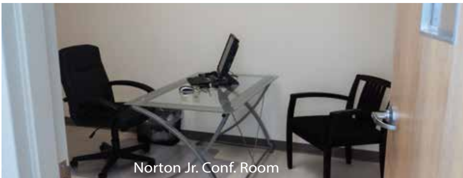
Norton Jr. Conf. Room

The Missouri Vineyards and Norton Conference Rooms are easily accessible from all parts of the Airport complex.