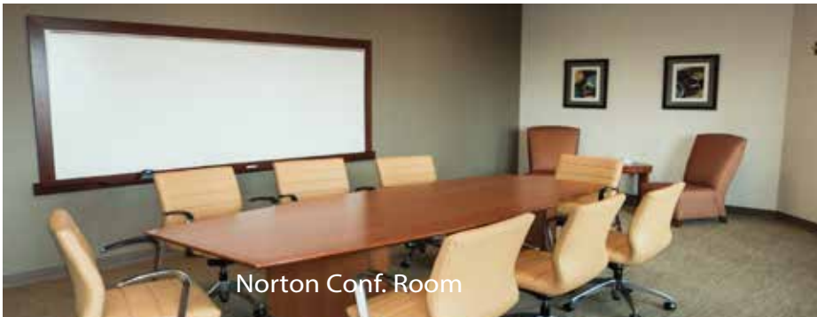
Norton Conf. Room