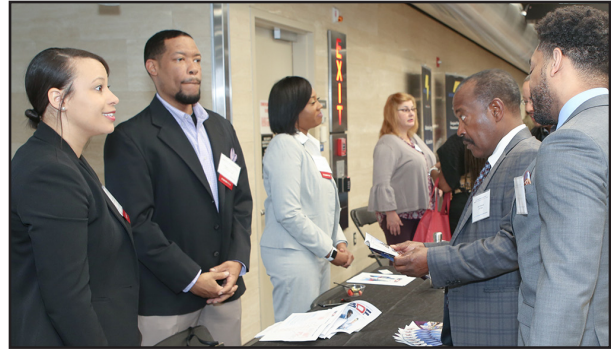
Attendees Network in the Exhibit Hall

The half-day Forum wrapped up with an exhibit hall featuring 60 exhibitors such as Aschinger Electric, KAI Design Build, Kozeny Wagner Construction all on hand to make important connections with attendees.