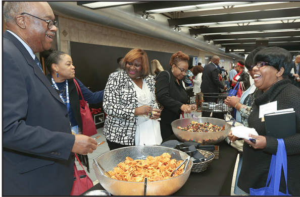
Attendees Network During Exhibit Hall

The Forum also featured a networking breakfast, roundtable discussions on development projects for St. Louis County, the Missouri Department of Transportation, the Metropolitan St. Louis Sewer District, Bi-State Development and the Small Business Administration.