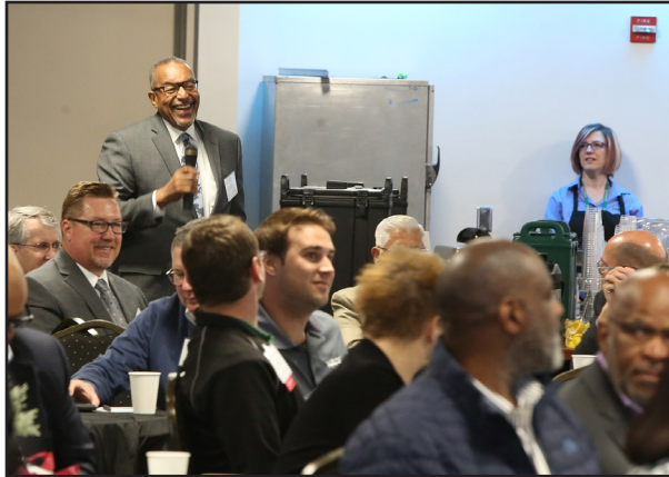
Question & Answer Segment