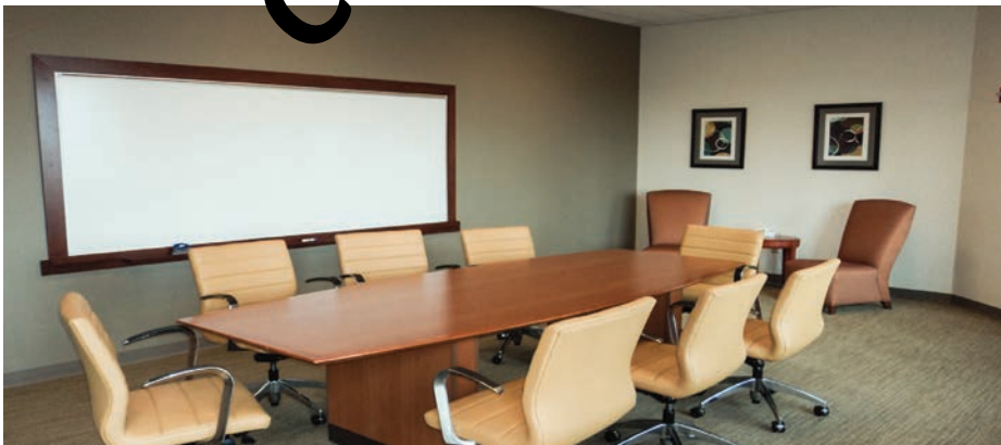
NORTON CONFERENCE ROOM